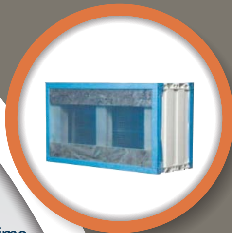
Pictured above: Uninstalled Pour-in-Place Buck