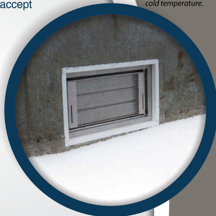
Pictured below: Model #1540-510 with its louvers in the closed position due to the cold temperature.