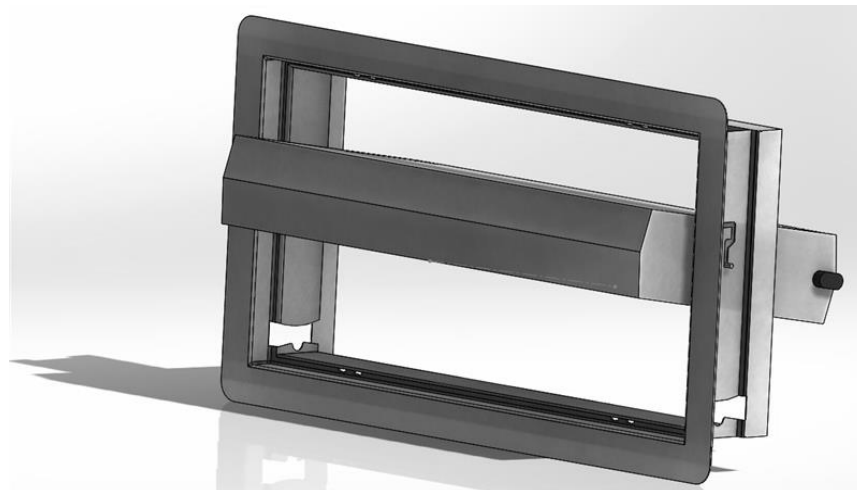
FIGURE 3—SMART VENT: SHOWN WITH FLOOD DOOR PIVOTED OPEN