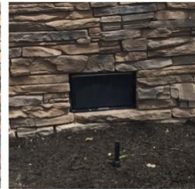
SMART VENT MODEL 1540-520 BY: