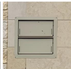
SMART VENT MODEL 1540-521 BY: