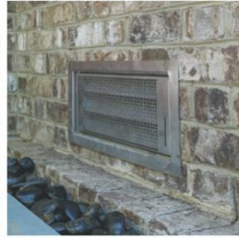
SMART VENT MODEL 1540-510 BY: