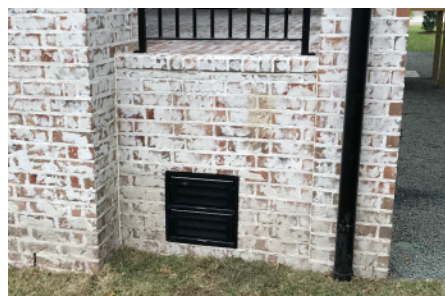
1540-521 SMART VENT