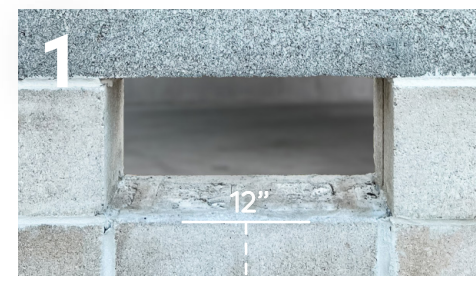
Prepare 16 ¼"W x 8¼"H Opening

Ensure the inside and outside are clean. The bottom must not exceed 12" above the highest adjacent grade.