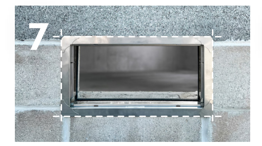
Ensure Vent Placement

Next, fully push the frame into the opening until it's flush with the wall. Ensure the vent tag sticker is on the bottom, facing up.