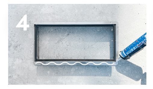
Apply Sealant On Flange

There will be two slots on the top and two slots on the bottom of the frame.