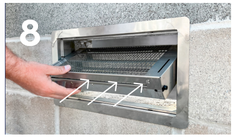
Slide Door Back Into Frame

Check that the frame is level, flat against the wall. Make sure slots are clear of debris and caulk.