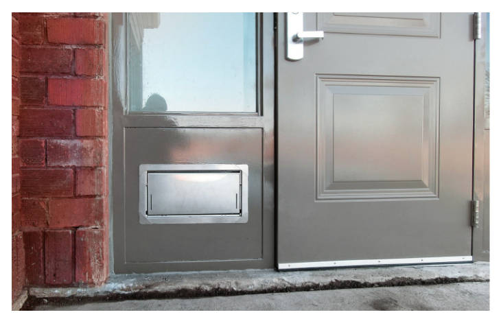
Flood Vent Installed in Lodge Entry Way

As a company, we strive ourselves on being the answer to uneasy flood related issues like this one. It's extremely humbling knowing we supplied the proper flood protection 5 years ago that kept the historic Credit Island Lodge safe and standing today. We're happy to know the lodge will continue to bring communities and families together for memorable events.