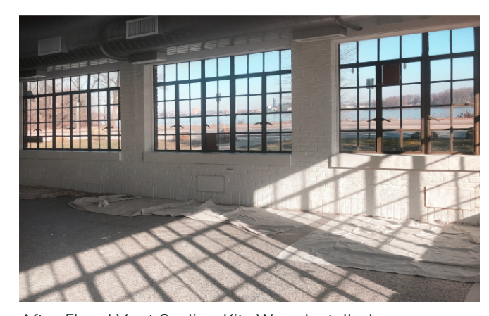
After Flood Vent Sealing Kits Were Installed