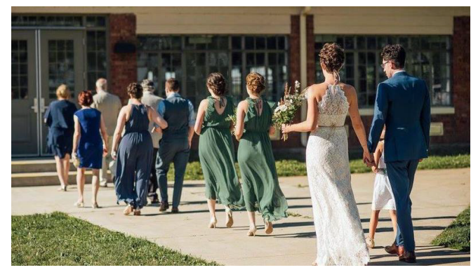
Weddings and events have uninterrupted building access before potential flood events due to wet floodproofing