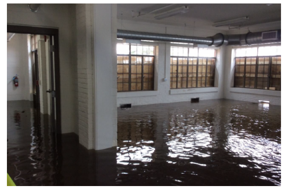
Flood Vents in Use During 2019 Flood Event